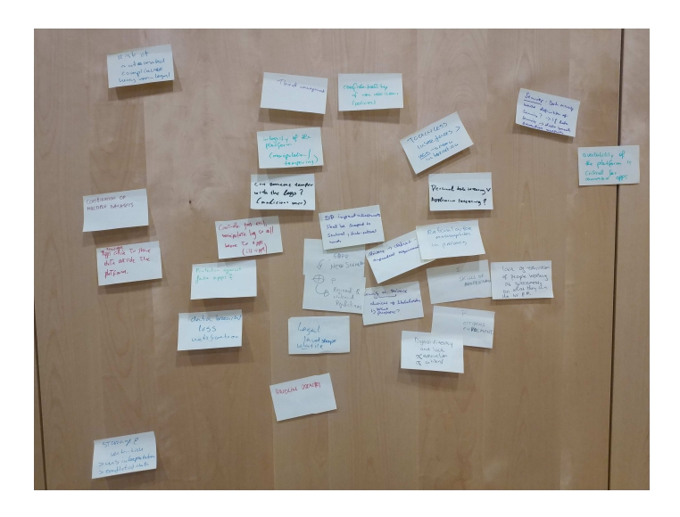
Figure 6. SPECIAL Public challenge workshop, Privacy & Security station