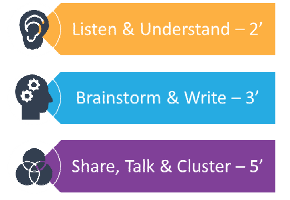
Figure 3. SPECIAL public challenge workshop, brainstorming process

Every round (Figure 3) would begin with the SPECIAL consortium representative explaining the theme of the station and providing a summary of the ideas already on the wall, if any, in no more than two minutes. The groups would then spend three minutes brainstorming and writing down their thoughts (using sticky notes). Finally, the teams would discuss the proposed ideas and questions for five minutes, while the SPECIAL consortium representative would attempt to cluster similar ideas together. Each group would then move on to the next station.