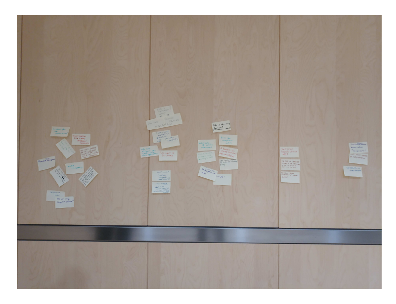
Figure 7. SPECIAL Public challenge workshop, Business Value station