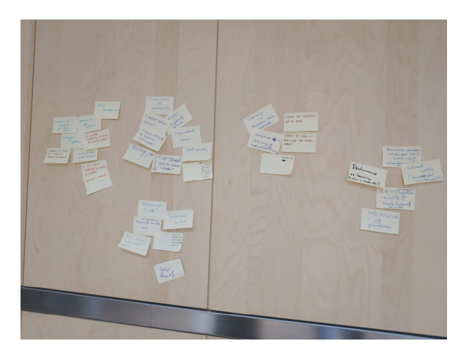
Figure 5. SPECIAL Public challenge workshop, Performance & Scalability station